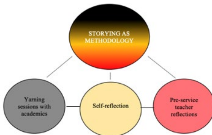
Figure 2: Storying and its connection to the three research methods