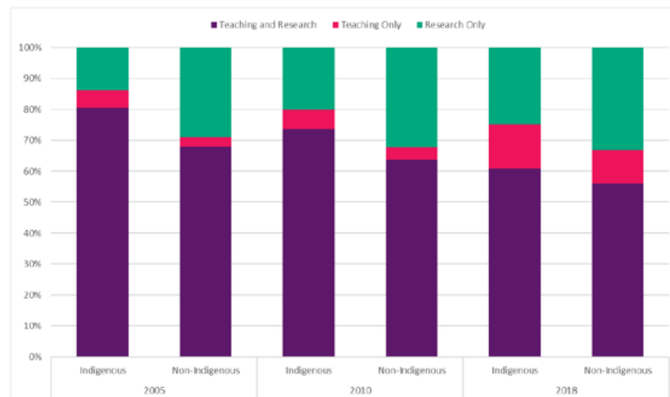
Figure 2: Teaching and research comparison between Indigenous and non-Indigenous staff from 2005 to 2018 (Universities Australia, 2020)